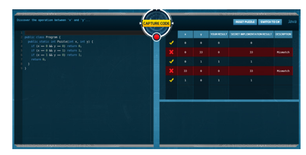
Figure 3 The Code Hunt main page, showing test results

The result will be either a compilation error, with information in the bottom pane, or some mismatches or agreements with the goal algorithm. Figure 3 shows the code on the left, and the mismatches (red crosses) and agreements (yellow checkmarks) are shown on the right. If the code compiles and there are no mismatches and only agreements with the goal algorithm, the player wins this level – or as the game puts it, the player "CAPTURED!" the code, as shown in Figure 4.