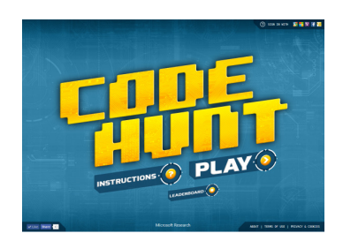
Figure 1. The opening screen of Code Hunt

Fun is seen as a vital ingredient in accelerating learning and retaining interest in what might be a long and sometimes boring journey towards obtaining a necessary skill. In the context of coding, there have been attempts to introduce fun by means of storytelling [2], animation (www.scratch.mit.edu) and robots (e.g. www.play-i.com). Code Hunt adds another dimension – that of puzzles.