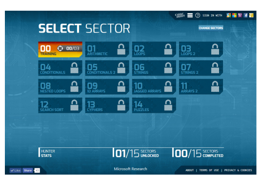
Figure 5. The game's sectors, unlocked as the user progresses

After each level, the player is directed to immediately attempt a slightly more difficult level, thereby maintaining flow. Furthermore, the sectors except for the first one are initially locked. Players have to complete enough levels in a given sector in order to unlock the next sector. Figure 5 shows the list of sectors, most of which are still locked.