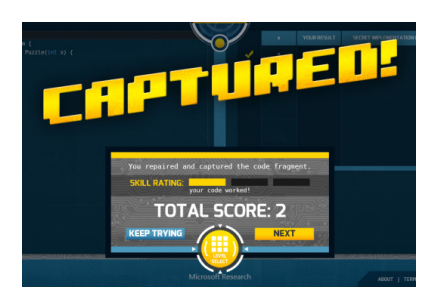
Figure 4. After completing a puzzle, the player gets a score

The result will be either a compilation error, with information in the bottom pane, or some mismatches or agreements with the goal algorithm. Figure 3 shows the code on the left, and the mismatches (red crosses) and agreements (yellow checkmarks) are shown on the right. If the code compiles and there are no mismatches and only agreements with the goal algorithm, the player wins this level – or as the game puts it, the player "CAPTURED!" the code, as shown in Figure 4.